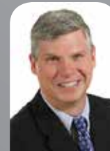
Ray Titus CEO UNITED FRANCHISE GROUP USA

"1997 was the first time I sold the master licence rights to the Signarama brand outside the US. New Zealand was the perfect choice and has consistently posted the highest average store sales out of all 40 global licences operating."