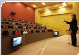
Sales & Marketing Training